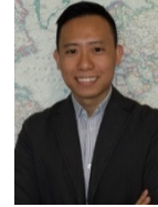
Ming Kuok Lim, UNESCO, Indonesia